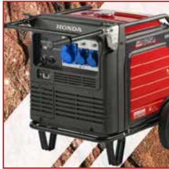
HONDA EU65i Inverter Generator 5.5kVA, Electric Start, Silent