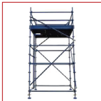
Quickstage Scaffolding Used for Heavy Loads such as Brickwork & Plastering