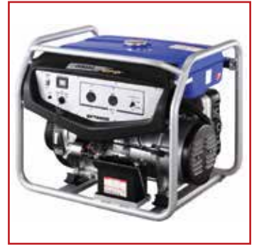
YAMAHA EF7200E 6kVA Petrol Generator Electric Start (Automatic Choke), AVR, Large 25.5L Fuel Tank