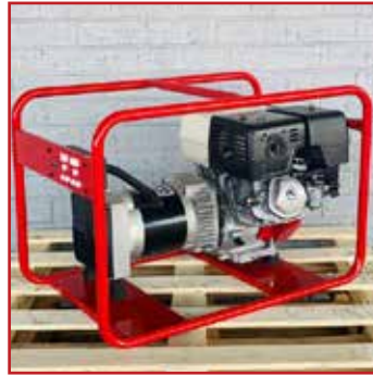
KWAGGA 6kVA Petrol Contractors Generator Honda GX390 Petrol Engine, Recoil Start