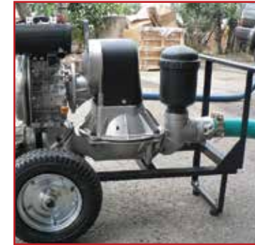
Caffini KDP75 Diaphragm Pump 75mm, Petrol or Diesel