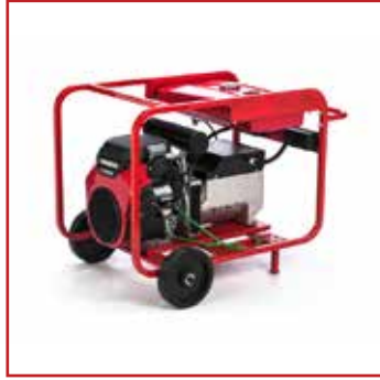
HONDA 10kVA Petrol Generator GX630 Engine, Electric Start, AVR