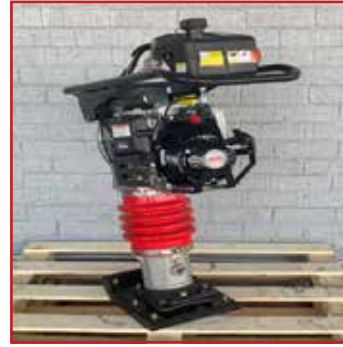
KWAGGA KR70 Rammer

Diesel Engine, 65 or 75 inch, HATZ or Yanmar