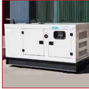
KWAGGA 12kVA Silent Diesel Generator FAW 1500 RPM engine, Weatherproof Sound Reducing Canopy, Automatic Changeover (ATS)