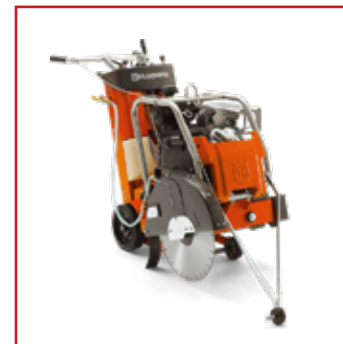
HUSQVARNA FS524\ Floor Saw

600mm Blade Guard, HONDA GX630 V-Twin Petrol Engine, max cutting depth 240mm