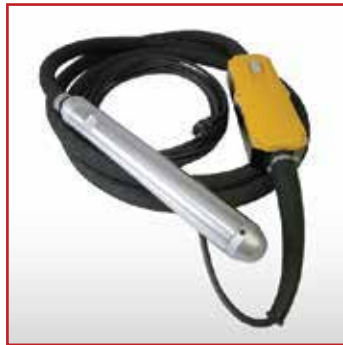
OLI EWO50C Poker Vibrator

Range of sizes & uses: Concrete, Asphalt, Stone, Granite, Brick etc