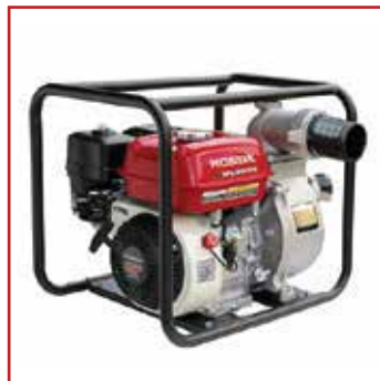
HONDA WL30xh Centrifugal Pump Available in 2,3,4 Inch, Petrol