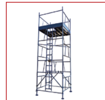
Quicklock Scaffolding Used for Painting, Cleaning, Signage & Maintenance