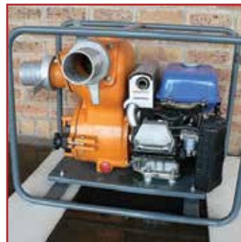
YAMAHA ETP100 Trash Pump Available in 2,3,4 Inch, Petrol