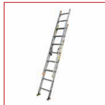
Extension Ladders Available in Variety of Lengths 3-6m, 6-12m, 7-14m