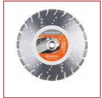
HUSQVARNA Diamond Blades

Range of sizes & uses: Concrete, Asphalt, Stone, Granite, Brick etc