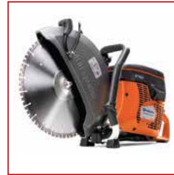
HUSQVARNA K760 Power Cutter

Planetary 3 head, Single Speed, 450mm Grinding Width