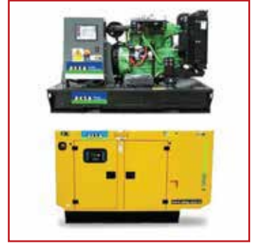
AKSA APD25A 25 kVA Silent Diesel Generator 3 Phase, Weatherproof Sound Reducing Canopy, Automatic Changeover (ATS)