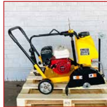
KWAGGA MF12 Floor Saw

220V, Electric, High Frequency, 38 to 65mm Head