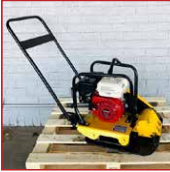
KWAGGA KPC90 Plate Compactor