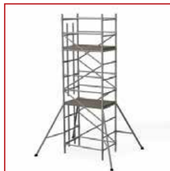
Aluminium Scaffolding Light-Weight, Rust-Free, Used for Maintenance, Signage