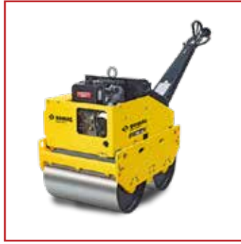
BOMAG Double Drum Pedestrian Roller

Diesel Engine, 65 or 75 inch, HATZ or Yanmar