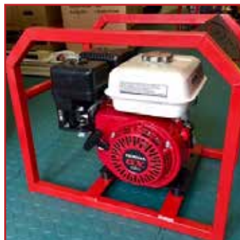
KWAGGA Drive Unit

36 or 42 inch , Honda GX160 or GX270 Petrol Engine