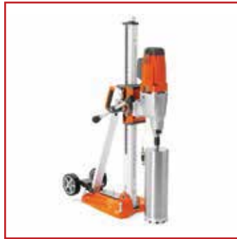
HUSQVARNA DMS240 Coring Machine

Drill Motor & Stand, Electric, Drill Bit Diameter Up to 250mm