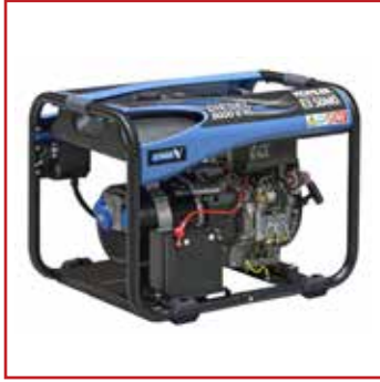
SDMO Kohler 6kVA Diesel Generator Key Start, Also available in Silent Canopy unit