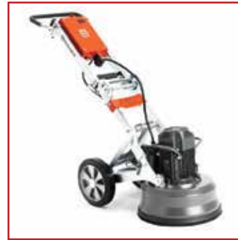
HUSQVARNA PG450 Floor Grinder

Drill Motor & Stand, Electric, Drill Bit Diameter Up to 250mm