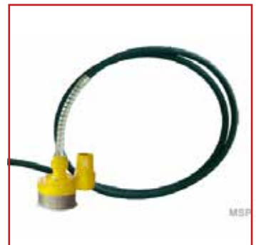
KWAGGA KSP50 Mechanical Submersible Pump

600mm Blade Guard, HONDA GX630 V-Twin Petrol Engine, max cutting depth 240mm