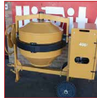
KWAGGA 400L Concrete Mixer

HONDA GX160 Petrol or HOFFMANN Diesel Engine