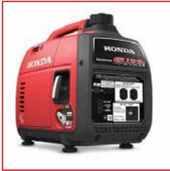
HONDA EU22i Inverter Generator 2.2kVA, 2200W