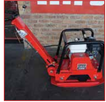
KWAGGA KRPC160 Reversible Plate Compactor