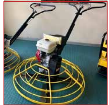
KWAGGA KPF42 Power Float

HONDA GX160 Petrol or HOFFMANN Diesel Engine