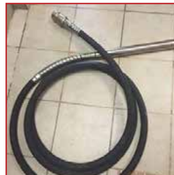
KWAGGA Vibrating Needle