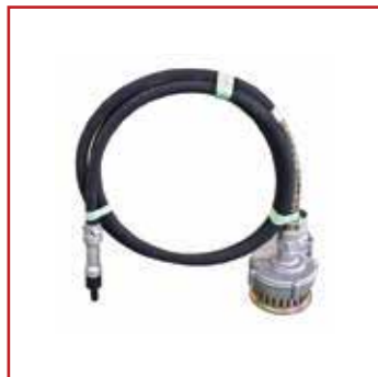
KWAGGA KSP50 Submersible Flexi Pump 50mm